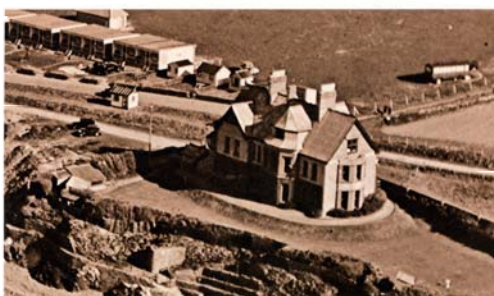
Seafield House from the North.

Seafield was built in around 1885 by Brinsley de Courcy Nixon, a London banker, as a summer residence for holidays with his family. He actually died here when on holiday in 1903. The old photograph shows the private stone staircase down to the beach for family swimming and picnics. The rough Atlantic Ocean has not been kind to the sea edge of the gardens, though remains of the staircase can still be seen from the beach. Like so many other houses here, Seafield was requisitioned by the Army in the war and painted grey. In 1950 the house was sold at auction and advertised a conservatory entrance, dining room, butler's pantry, kitchen with Beeston boiler, scullery, servants' hall, extensive cellars, a maids' sitting room and ten bedrooms. Subsequently the house became a small hotel before falling into disrepair, becoming a rather well-loved romantic ruin of its former self as the sea continues to encroach on its beach-side location. Morley Road itself was constructed specifically to be an access road and drive to Seafield House, although the very old former road to the western end of Westward Ho! is still there as a bridleway at the foot of the Tote.