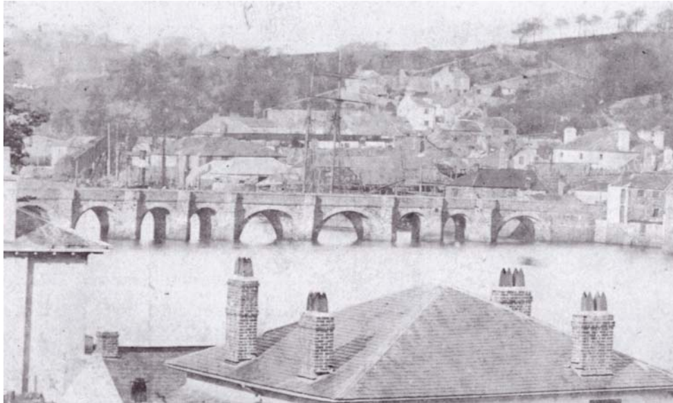
a rare pre-1864 photo of the Bridge taken from my 'Illustrations of Old Bideford'.