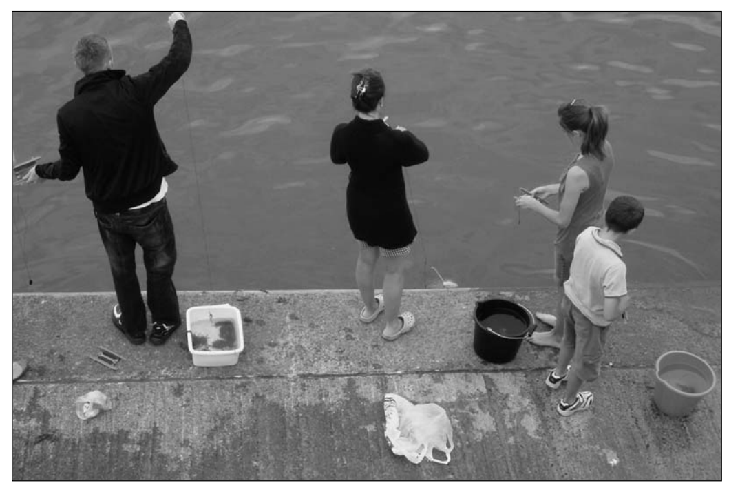
Crabbing at Appledore

Make sure you're ready to be in with a chance of winning the night out at Lathwells Restaurant!