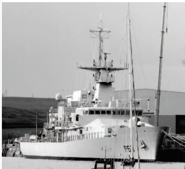
LE W B Yeats.