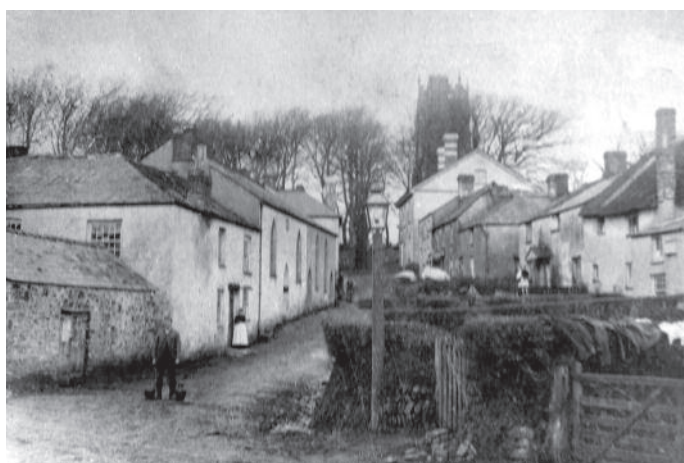
Photo shows Chapel Street, Woolsery in Victorian times.