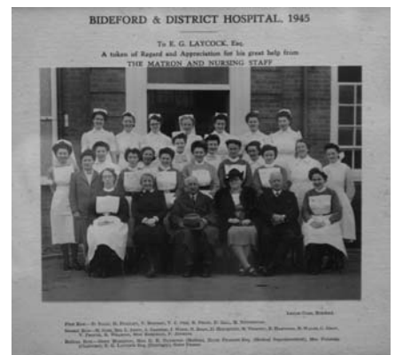
Photo of Bideford and District Hospital 1945