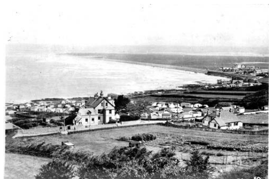
Northam Burrows and Westward Ho! (Circa 1950)

Anyone who has any information on any fly tipping incidents can call the Environmental Protection team on 01237 428810, or specifically about Northam Burrows please call the Burrows Centre on 01237 479708.