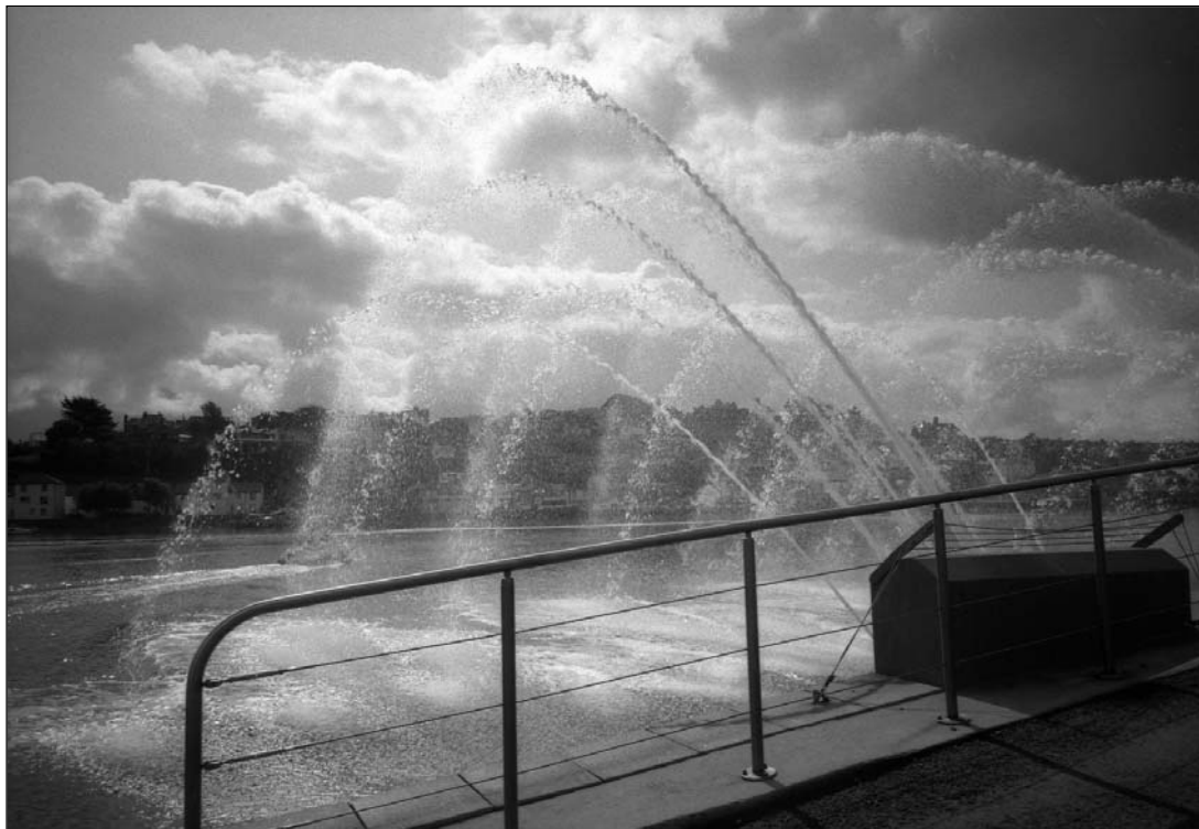
Bideford Fountain